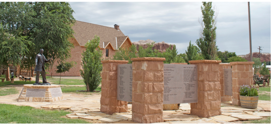
The new monument commemorates those called to the San Juan after the arrival of the initial settlers.

Elder Snow was called to serve as a member of the First Quorum of the Seventy of The Church of Jesus Christ of Latter-day Saints in March of 2001. Snow is a great-great-great grandson of Apostle Erastus Snow who issued the