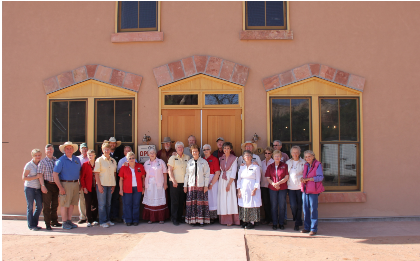
The 2013 Church Service Missionaries in front of the nearly completed Co-op store — waiting on the stone facing.