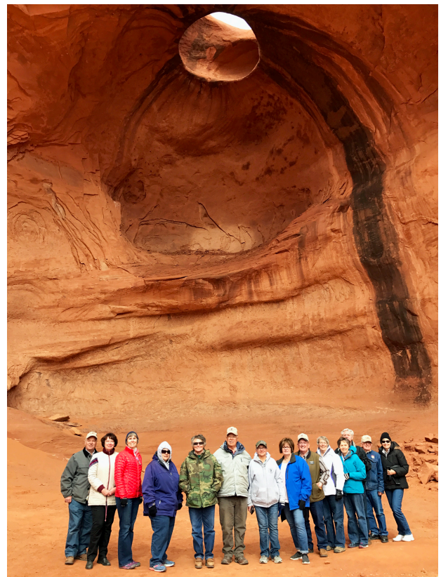
2017 outing to Monument Valley (Navajo Tribal Park)

exists where stories are told and handmade crafts are sold. The craft center is a busy place with sewing, weaving and quilting projects always going on. A work shop with up-to-date tools and wood working equipment supports construction projects and various crafts. But the most rewarding blessing comes from the visitors you meet. The original San Juan Mission lives, we cannot proselyte, but we can tell the story of faith and hope and courage. Almost 60,000 visitors last year, 40% from European Countries, came to hear the story and visit the site. There is