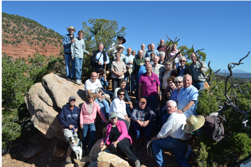
Reunion of missionaries in 2015 took us to top of Salvation Knoll.

from the past stands as a monumental fortress for the future.