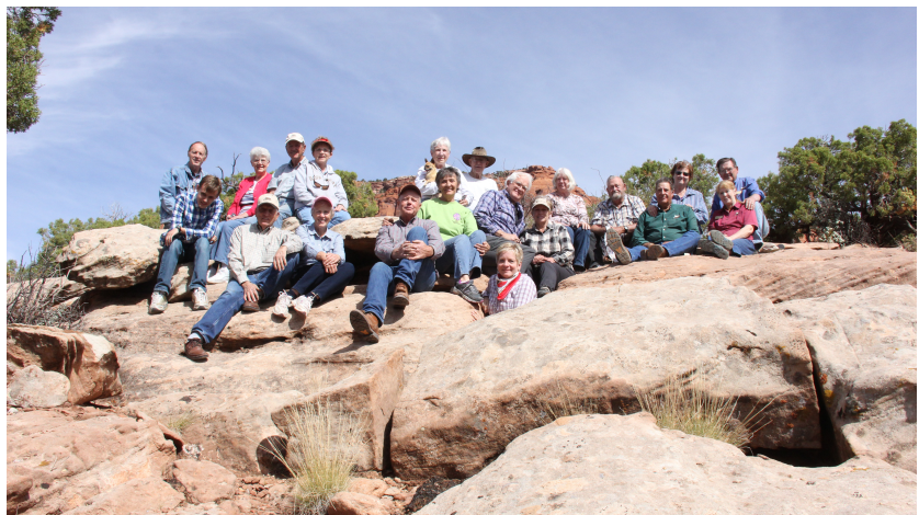
Field trips help acquaint the missionaries to the local area.

Descendants came to help; moved upon by some unforeseen spirit to go, to help, to donate time and money. Descendants of other Hole-in-the Rock