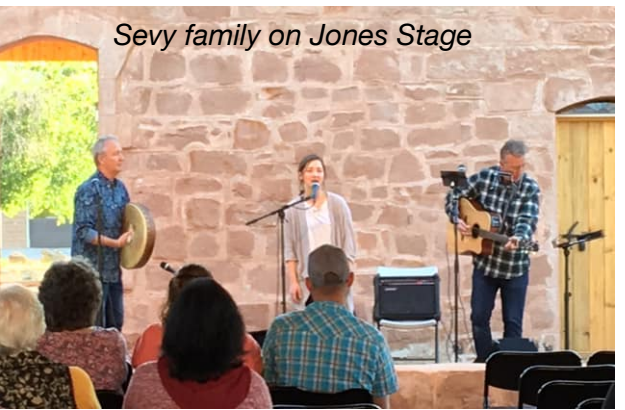
Schedule subject to change. See <u>Bluff Fort/Hole in the Rock</u> Pioneers on Facebook for updates.

Docent: do-cent, doh-suh nt: A person who is a knowledgeable guide, especially one who conducts visitors through a museum and delivers a commentary on the exhibitions.